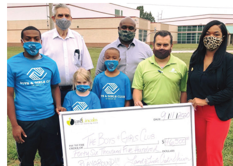
Playground Donation to Boys & Girls Club of Decatur.