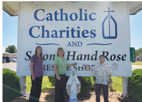
Donation to Effingham Catholic Charities.