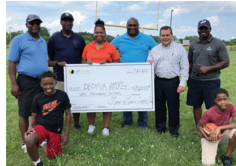
Donation to Decatur Junior Football League.