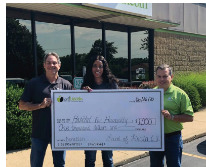
Donation to Decatur Habitat for Humanity.