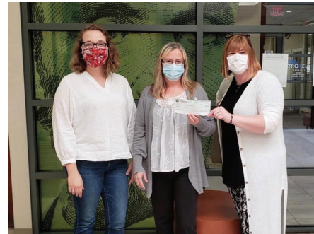
Catholic Charities of the Diocese of Springfield.