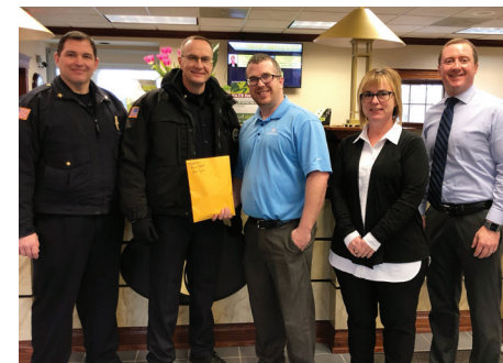
Donation to Mattoon Police Department.