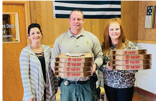
Pizzas delivered to Vandalia's Sheriff's Office for National First Responder Day.

in partnership with a grant from the Federal Home Loan Bank of Chicago. There are many other instances to account for the past year; we hope to continue to support our communities in 2021.