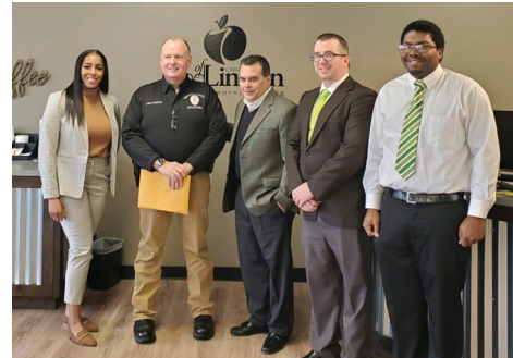
LLCU donation to Centralia Police Department.