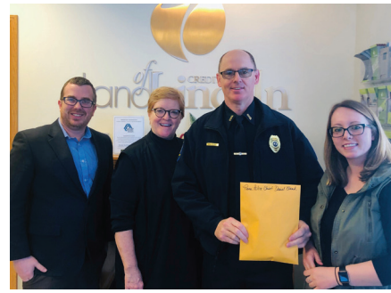
LLCU Donation to Pana Police Department.