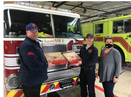
Pizzas delivered to Mt. Zion Fire Dept. for National First Responder Day.