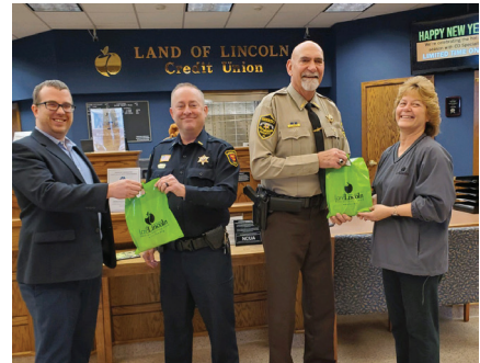
Donation to Effingham Police & Sheriff Departments.