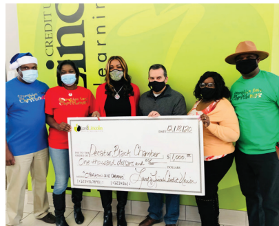
Donation to the Greater Decatur Black Chamber "Operation Save Christmas".